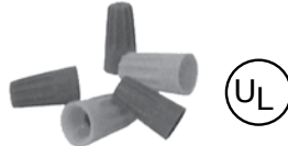
*Screw-On Wire Connectors